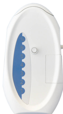
SignWave Telecare Link