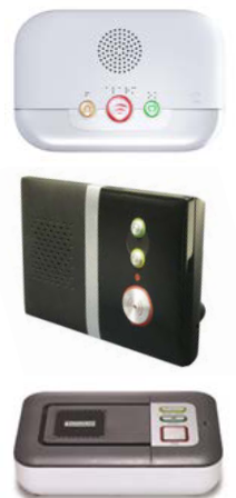
Telecare Communicators with external input capability